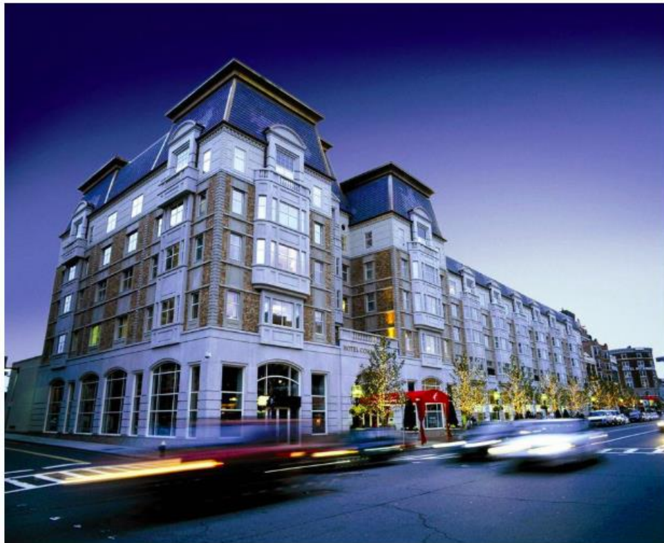
Hotel Commonwealth HOTEL COMMONWEALTH

Exploring the world for 3 decades and counting