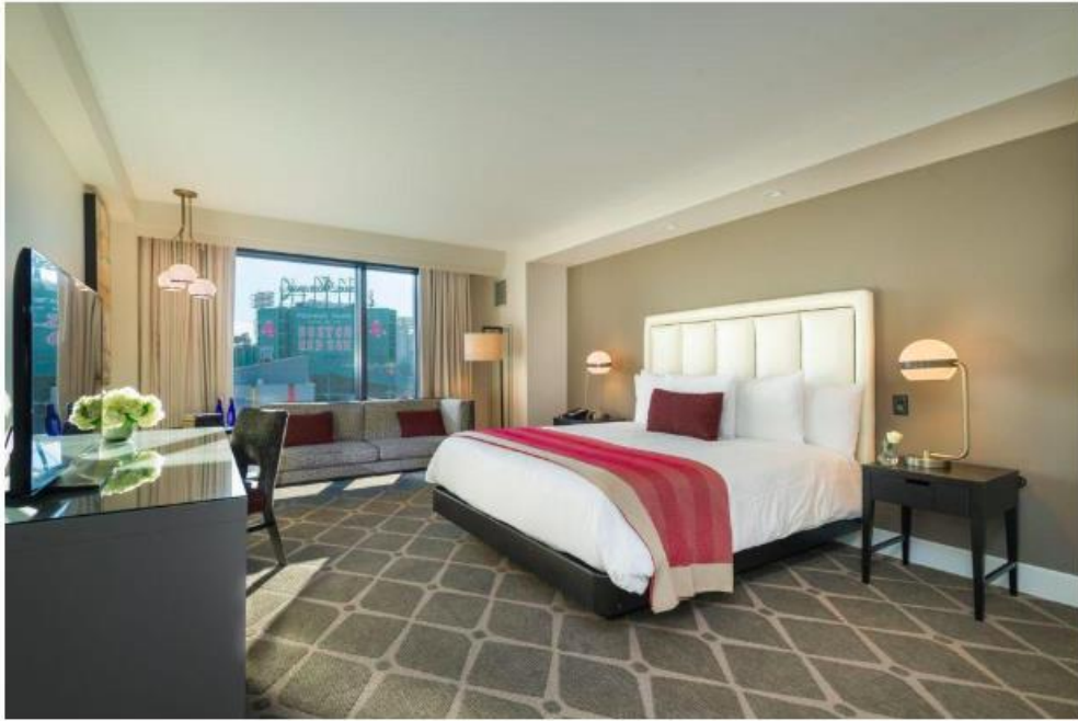
Fenway Guest Room, with a view of the legendary Fenway Park HOTEL COMMONWEALTH

On a return visit to my hometown, my Fenway Guest Room had that amazing view, a light and spacious aerie of 470 square feet. There were two Queen Beds, imported Italian linens, nice down comforters and enough pillows to lie there comfortably and gaze at the nation's oldest ballpark. The bathroom with a sliding barn door and large glass-enclosed shower was great, as were the Malin+Goetz toiletries.