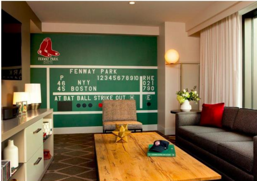
Fenway Park Suite HOTEL COMMONWEALTH

On a return visit to my hometown, my Fenway Guest Room had that amazing view, a light and spacious aerie of 470 square feet. There were two Queen Beds, imported Italian linens, nice down comforters and enough pillows to lie there comfortably and gaze at the nation's oldest ballpark. The bathroom with a sliding barn door and large glass-enclosed shower was great, as were the Malin+Goetz toiletries.